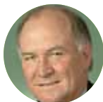
Tony Windsor MP Representative of the people of New England in the Australian Parliament and Primary Producer.